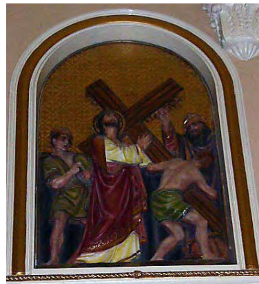
JESUS IS LADEN WITH THE CROSS