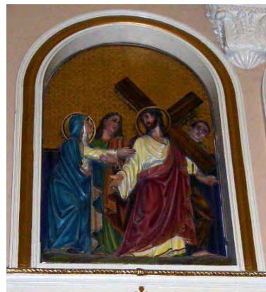
JESUS MEETS HIS BLESSED MOTHER