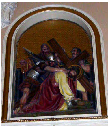
JESUS FALL UNDER THE WEIGHT OF THE CROSS